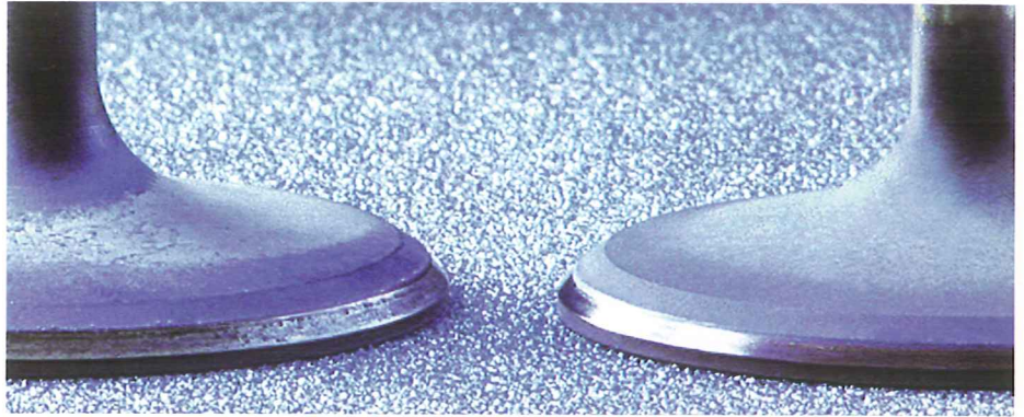
Fig. 1 – Identical valves, run under identical conditions. Uncoated on left, coated on right.

Carbon Raptor coated valve seats also reduce damage and wear rates to cylinder head seat inserts compared to uncoated valves. The benefit is a longer life for original seat insert shape