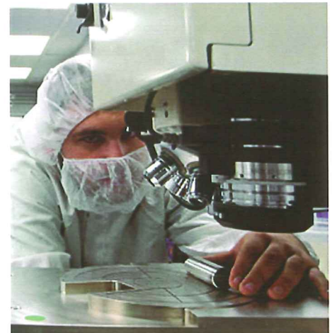
State-of-the-art vacuum plasma technology assures consistency and reliability.

Heat Transfer - Unlike other coatings, Carbon Raptor is a good thermal conductor, lengthening the life of components by spreading heat away from hot spots.