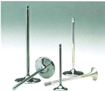
Coating options include the tip, head, stem or the entire valve to suit your application.

Another benefit is that valve manufacturing steps are simplified by eliminating the sequence of undercutting, spray application, and regrinding to finish dimensions. Manufacturing processes can focus on grinding the stem to dimension and geometry and then finishing. Carbon Raptor adds 2 microns, or 80 millionths inch to the surface, which can be accommodated with guide sizing or stem machining.