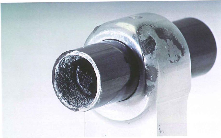
Figure 2. A close up of the piston pin in small end of a connecting rod. Parts courtesy of Quest Racing, Worcester, Massachusetts.