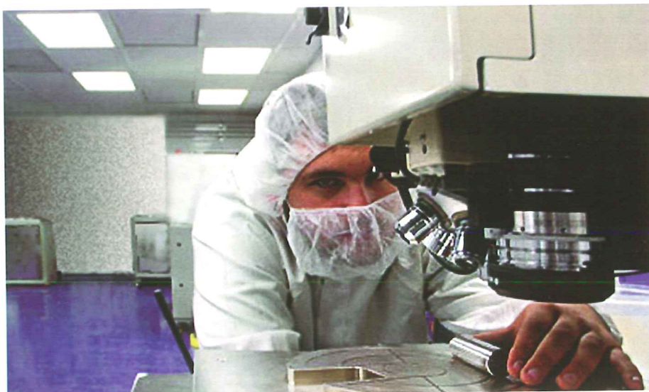
Figure 3. Anatech's state-of-the-art technology assures consistency and reliability.