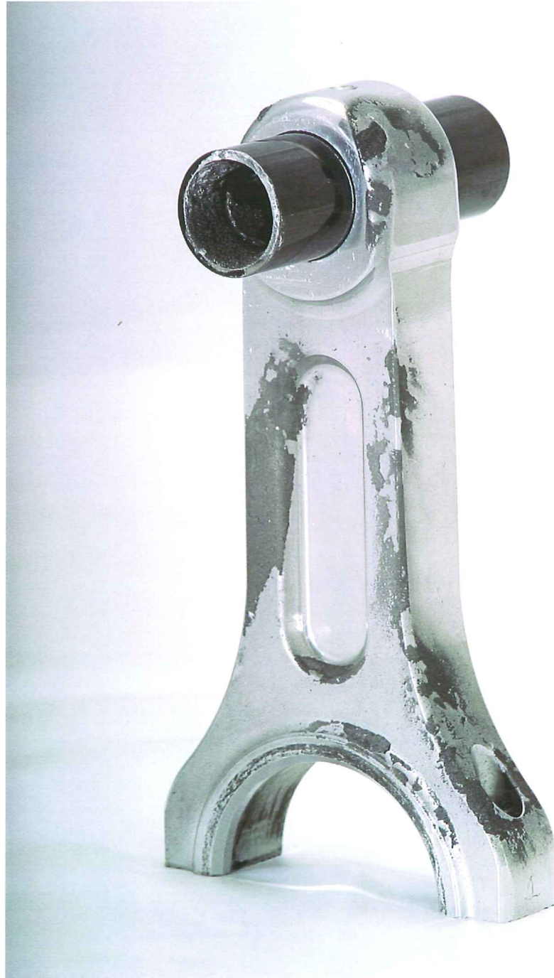
Figure 1. A Carbon Raptor coated piston pin that saved an engine block in a blown alcohol drag racing application. Parts courtesy of Quest Racing, Worcester, Massachusetts.